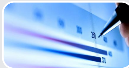
Economics and Business