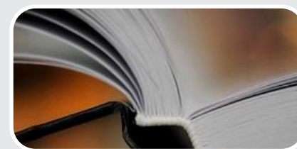
Educational Sciences and Social Work