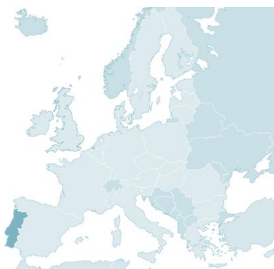
Portugal in Europe

The company was formed as a result of its founder experience with international projects and partnerships from all over Europe (Finland, Greece, France, United Kingdom, Italy, Czech Republic, Slovakia, German and Spain) and with educational projects from Portugal to Lusophone Africa, for the past twenty five years. Also participating in CEDEFOP and EFVET meetings, conferences and working groups. With this experience the founder surrounds his self with multitask and different background professionals, whose currently work with him and constitutes Latitudequation International Projects team. From experienced to younger and innovative ones, all team members are multifaceted and have international experience and training.